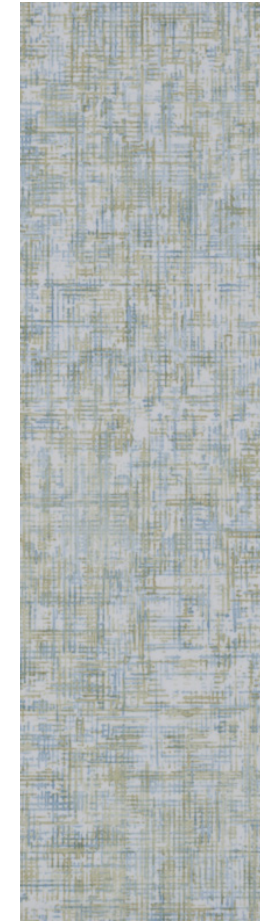
TA004006 Canyon Creek