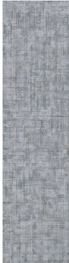
TA005006 Glacier Bay